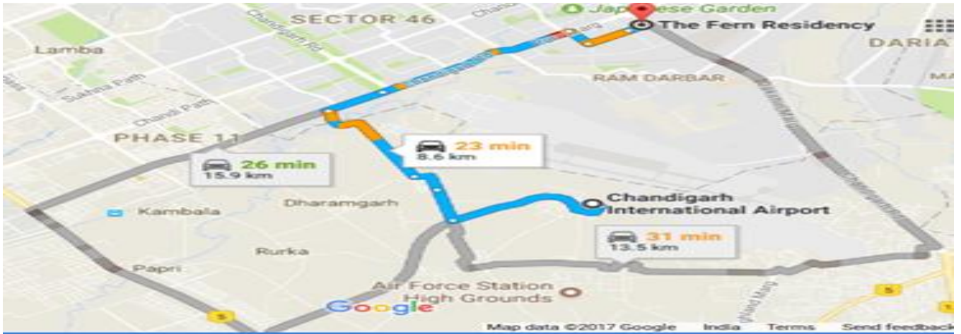
Distance from Chandigarh International Airport 8.6 Km

DATE & TIME: Thursday September 28, 2017 @ 09:00 A.M.